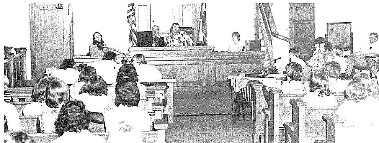
Court is now in session.